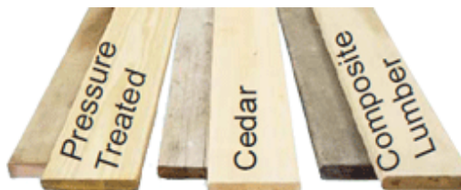
The above shows the contrast between new deck boards (right hand side) and those that have been exposed to the elements for two years (left hand side).

A robust timber frame supports the spa, this is pressure treated by forcing preservatives into the wood which protects it from insect infestation and fungal decay. This heavy-duty frame is perfect for extreme outdoor conditions and we believe superior to metal frames which are prone to corrosion failure, particularly on the welded joints.